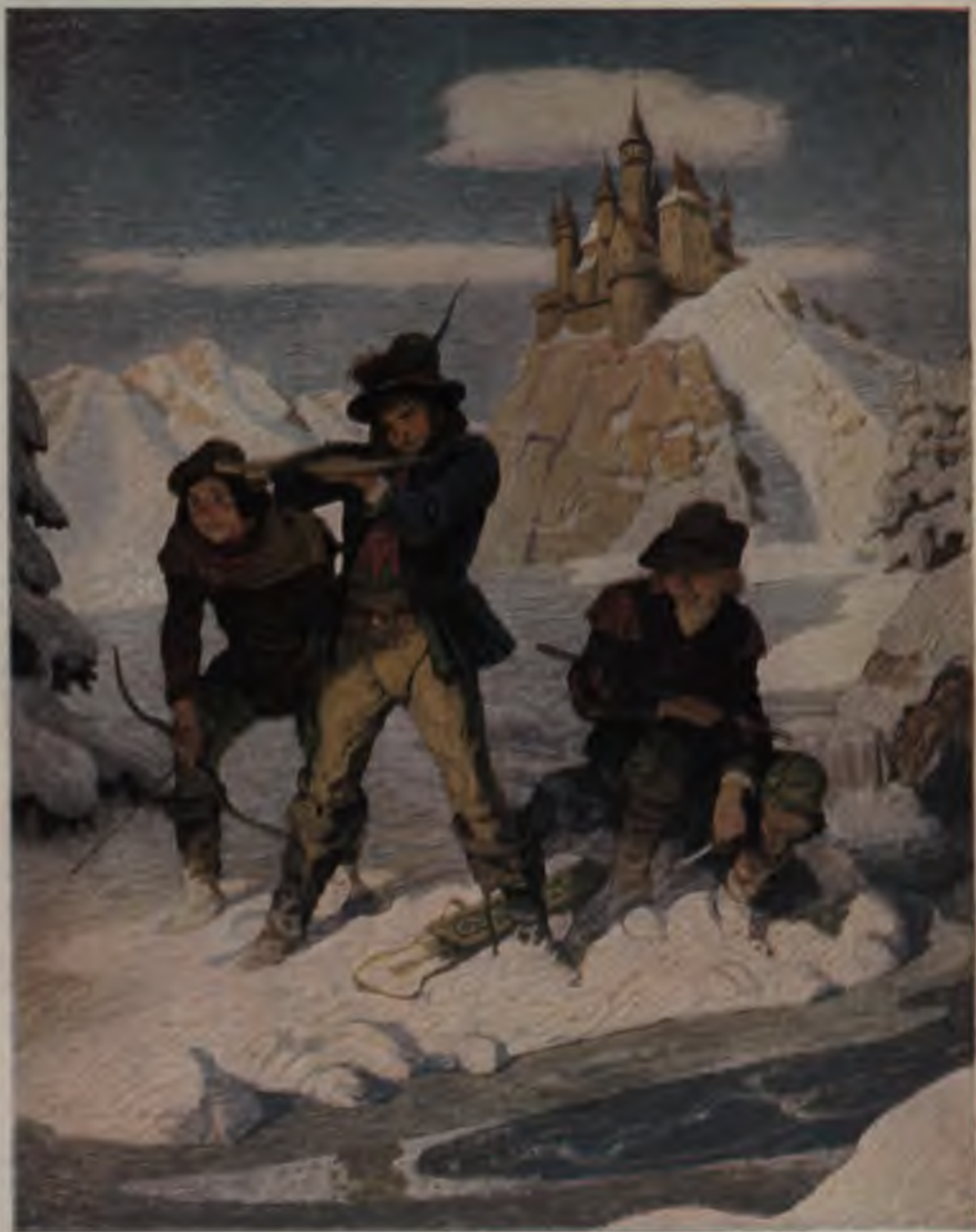
ESELDORF WAS A PARADISE FOR US BOYS